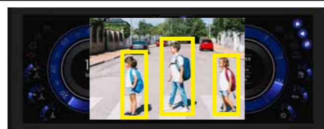
1 camera - person detection

AMETEK VIS 287 27 Road Grand Junction, CO 81503 USA